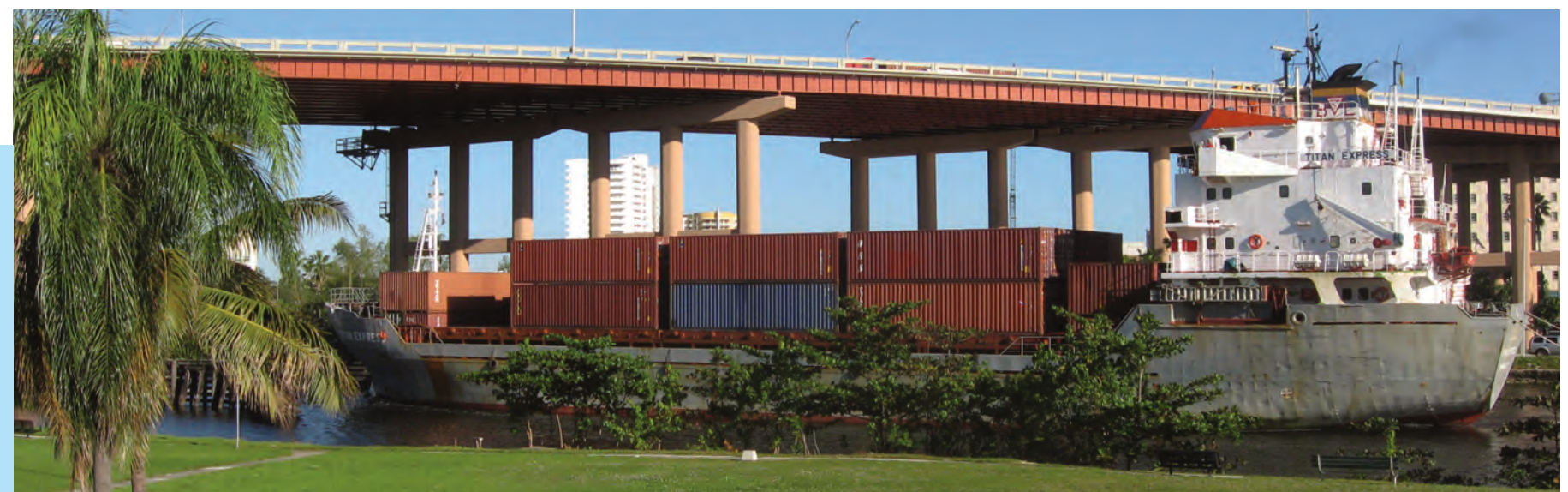
Cargo-loaded international shipping vessel navigating the dredged Miami River's federal navigable channel.